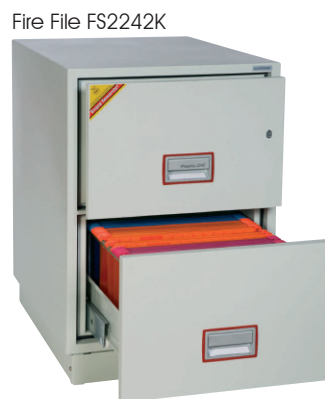
Fire File FS2242K